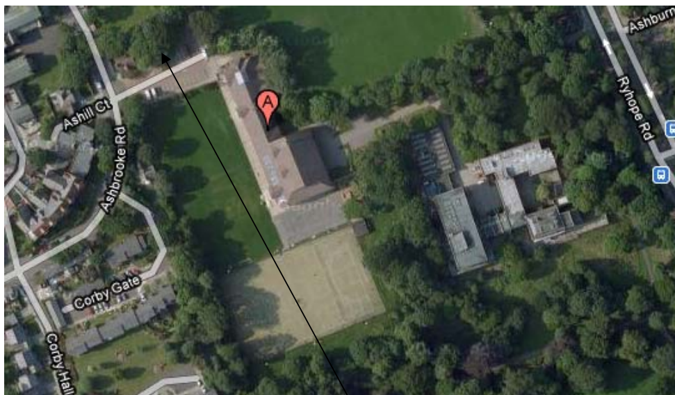
Car parking for visitors and parents